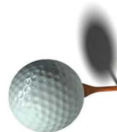
Ninth Annual Golf Tournament